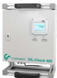
Handle and stand